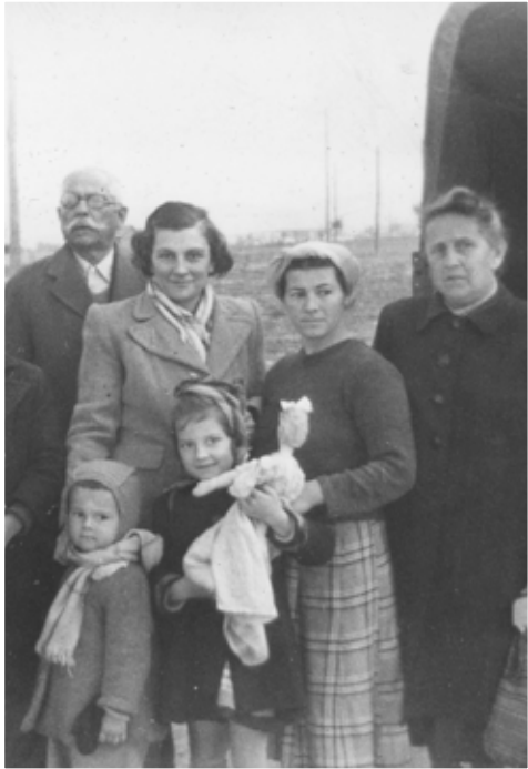
"On April 6, 1950, our neighbors drove us to the port of Piraeus..."